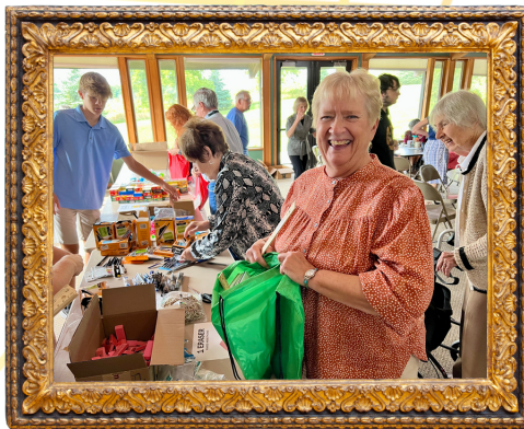
Assembling School Kits