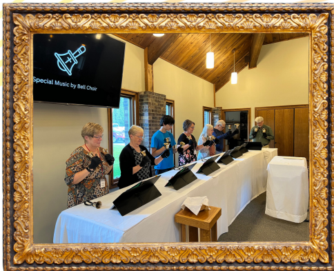
CTK Handbell Choir