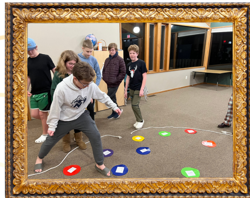
Confirmation Class Reviewing the Apostle's Creed