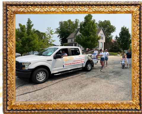
Representing CTK in the Port Fish Day Parade