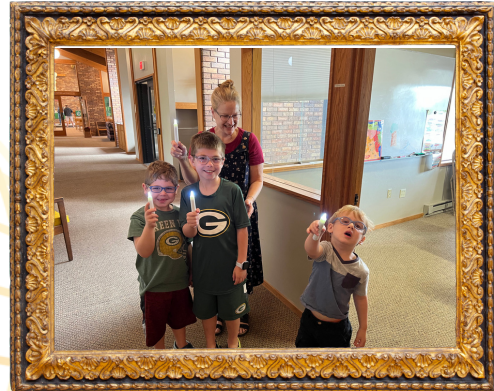
Learning About Jesus, the Light of the World