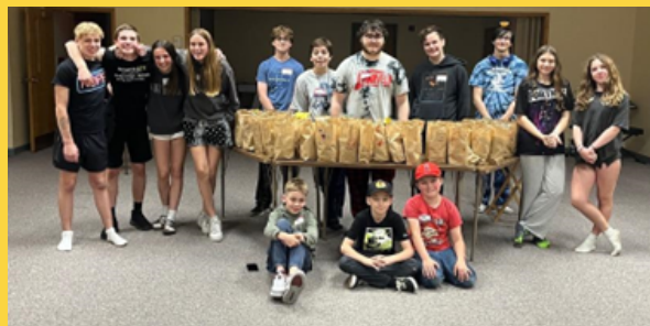
As part of our late night lock-in fun we assembled 80 sack lunches for Milwaukee Rescue Mission.