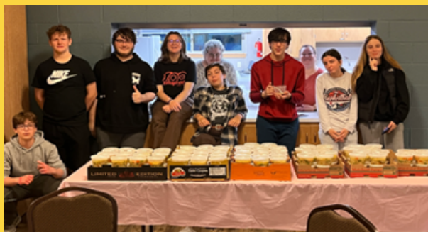
116 pints of homemade chicken soup, most of which were donated to the Ozaukee Food Alliance.

We are so grateful for all of your prayers and continued financial support that help make all of our events throughout the year possible. As we look back on the 2023-2024 school year, it was wonderful to see so many students involved - having fun, serving their neighbors, and growing in faith. We had 33 students participate in at least one event during this past program year, and we always look forward to welcoming more! We've got a couple of fun things planned for the summer (see below!) and a lot of great opportunities on the horizon come fall, so if you have kids or grandkids in grades 5-12, please encourage them to check us out!