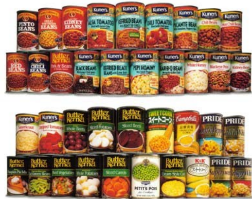
2025 Food Donations/Purchases vs. Food Distribution