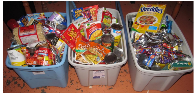
2025 Food Donations/Purchases vs. Food Distribution